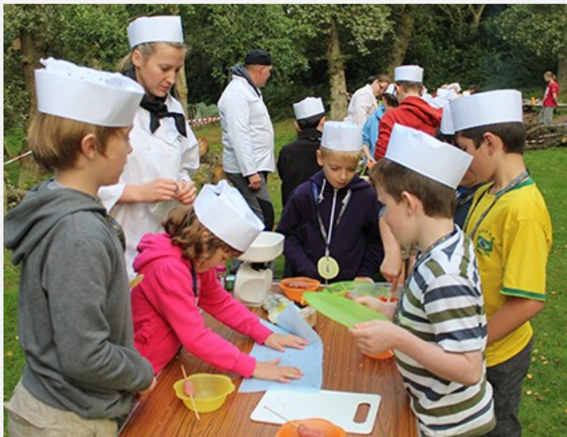
Young Chefs at District Cub Camp 2013