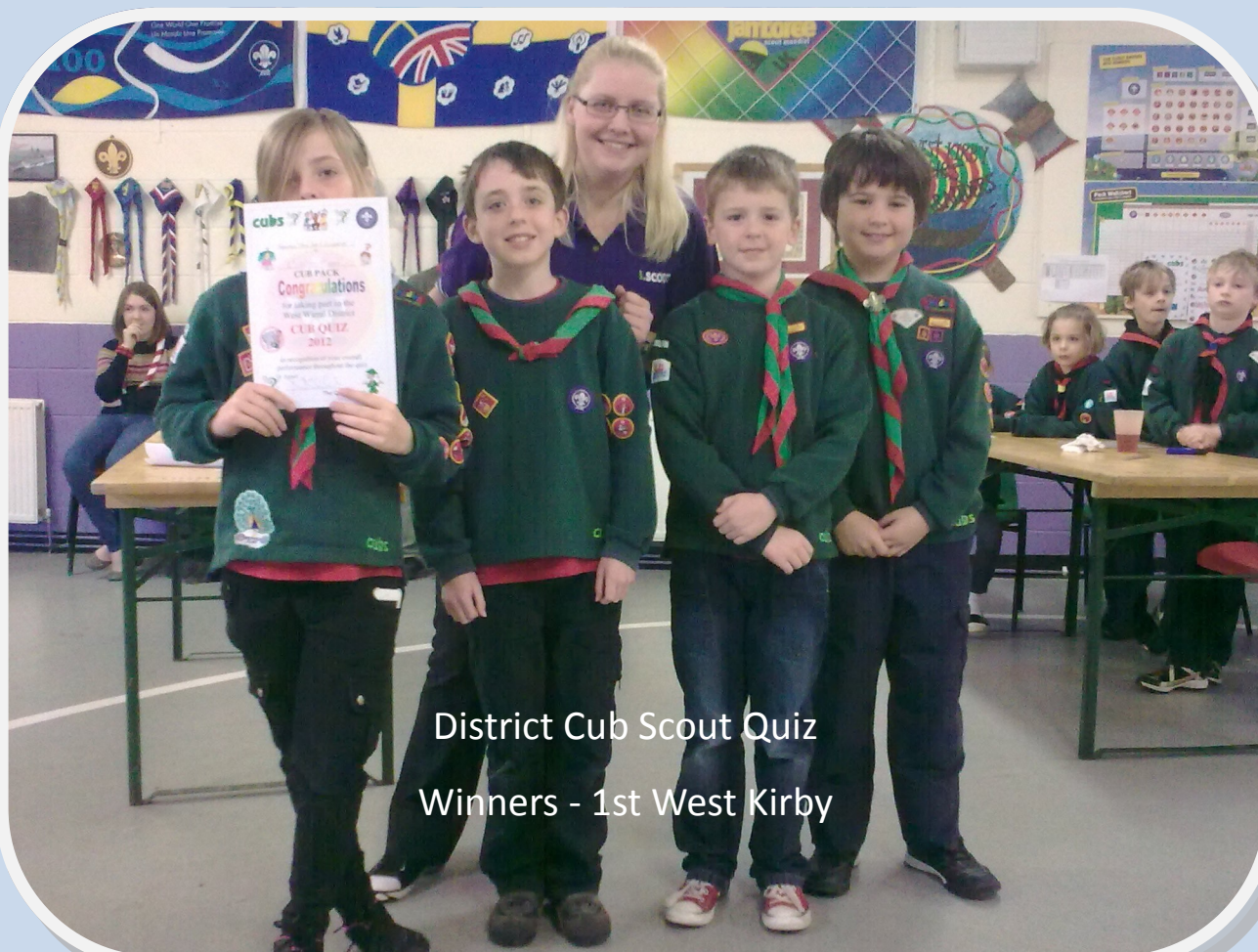
District Cub Scout Quiz Winners - 1st West Kirby