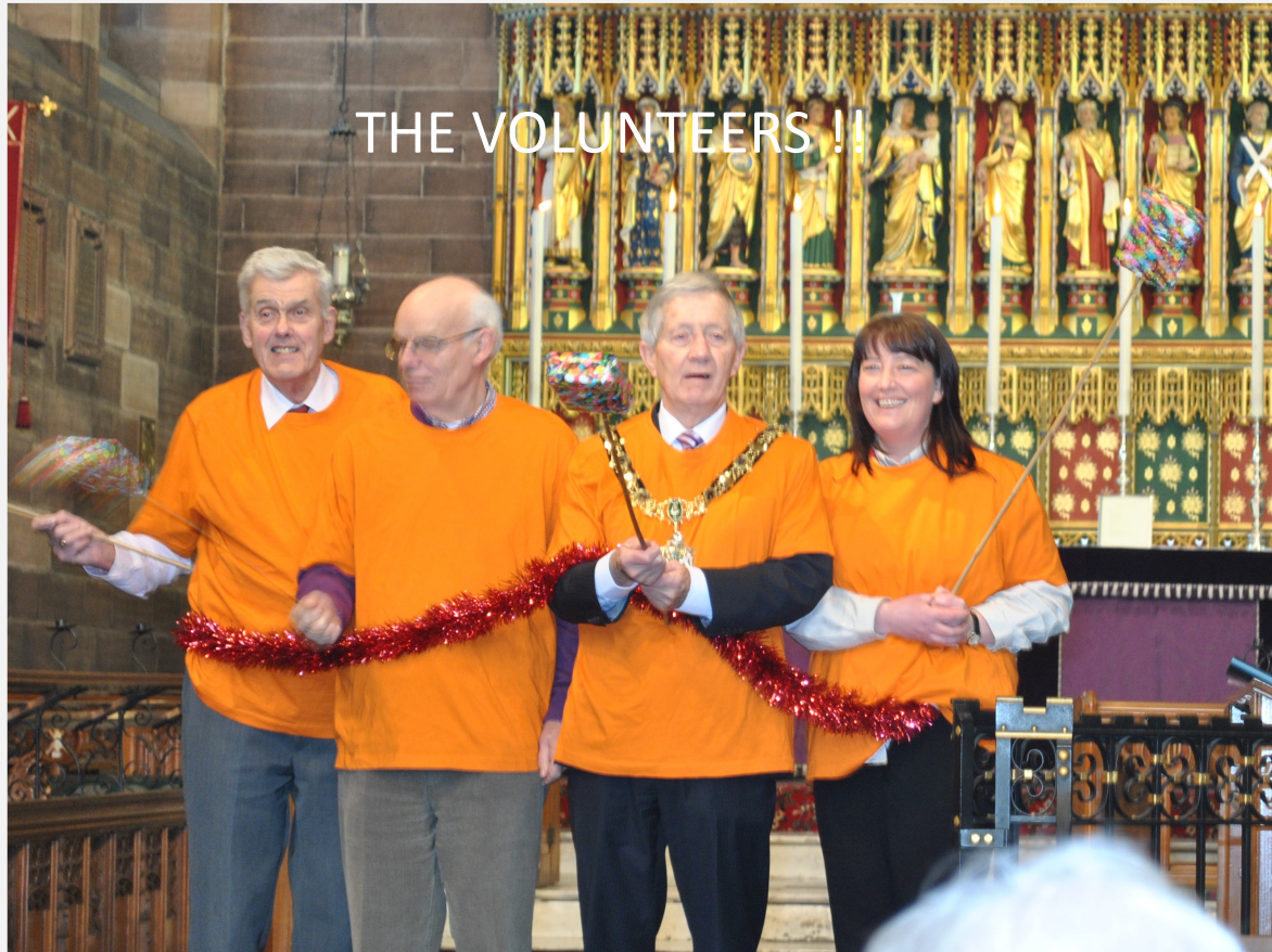
THE VOLUNTEERS !!

I cannot believe how long it is since the Beaver Craft Day when we had over 80 Beavers yet again making the most wonderful things. I don't know why I am still amazed at what is made both in terms of variety and quality. We really do have some very talented leaders who come up with new ideas year after year and Beavers who rise to the challenge