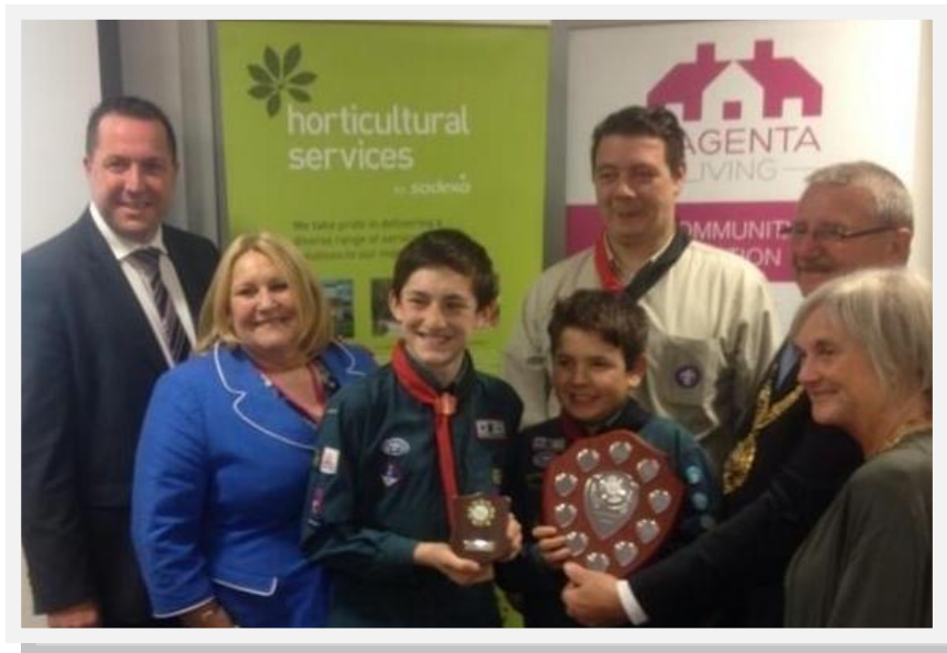
Two very happy Scouts receive the award!

Well done 2nd Greasby on this fantastic achievement!