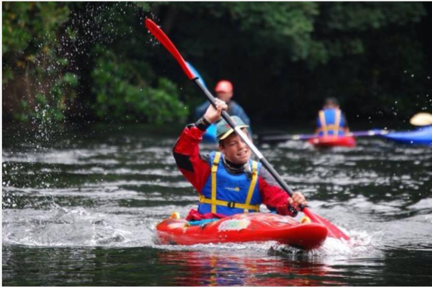
5 th Heswall Scouts enjoying water activities at summer camp.

A huge vote of thanks and to all the leaders involved in organising those trips and making them such a success, what a team we have in West Wirral!