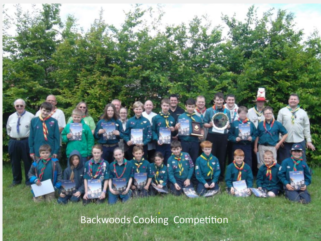
Backwoods Cooking Competition

At the time of writing many Troops are busy enjoying their summer camps and I look forward to hearing all about those adventures after the summer break.