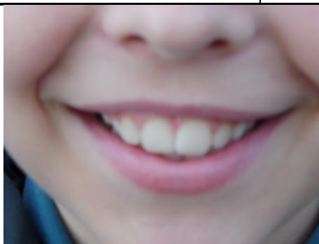
A Scout smiles & whistles