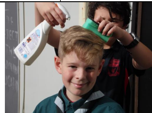
A Scout is clean of thought