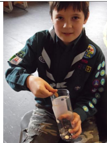
A Scout is thrifty