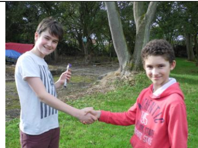
A Scout is Courteous