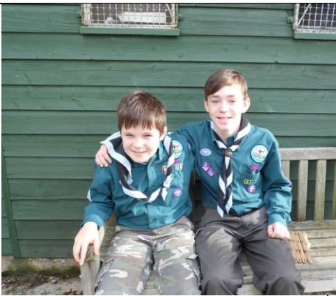
Scout is Friendly