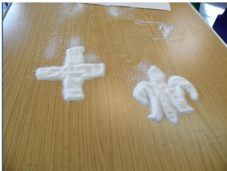
More of the sugar art for JOTI

Already looking forward to next year's JOTI (if only we could figure out how to make the sound work!)