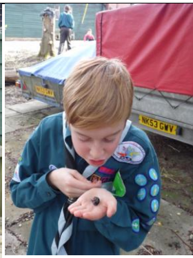
A Scout is a friend to animals