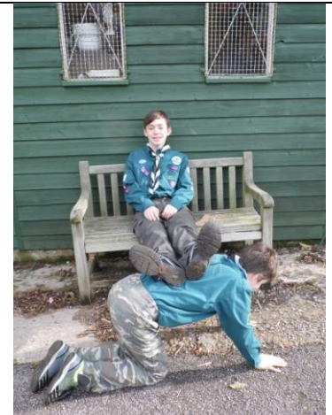
A Scout is helpful to others