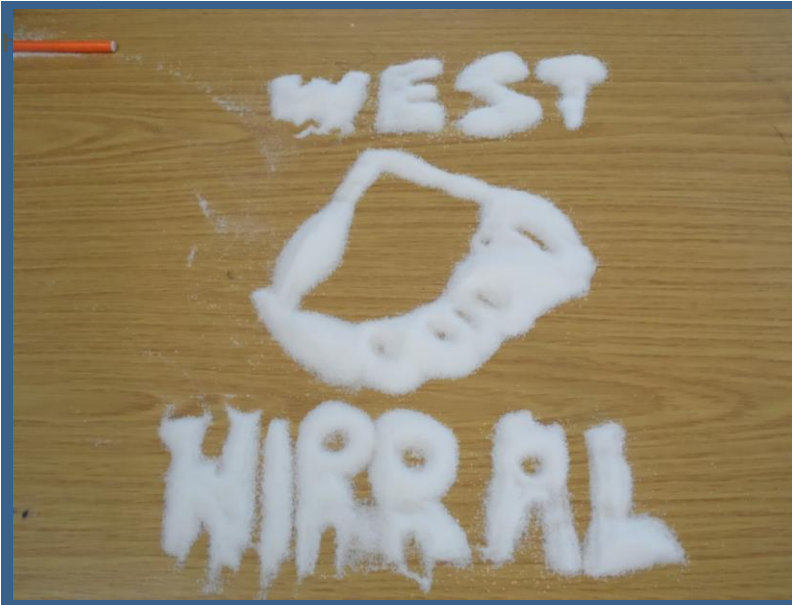
Drawing made from sugar as part of the JOTI weekend activities.