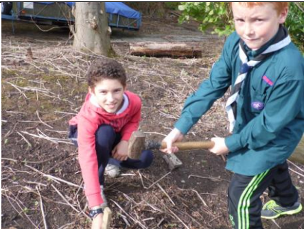
A Scout is Trusted