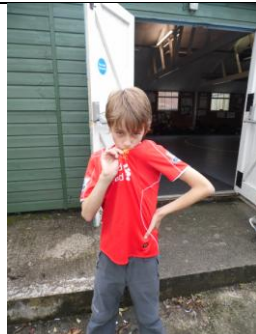
A Scout is Loyal