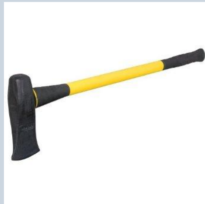
The splitting maul. Used properly will split tree trunks in half!