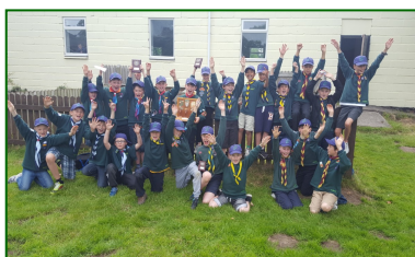
Cub Skills Day - Sat 25 June Frankby Greasby HQ