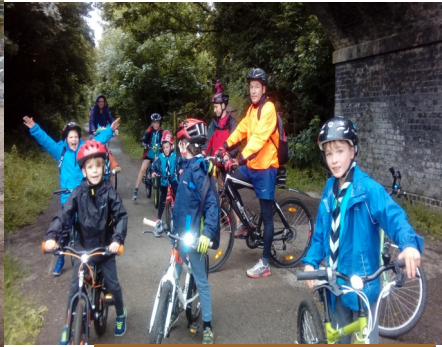
Here's a selection of photos of 1st Thurstaston Beavers enjoying a bike ride along the Wirral Way, in Ashton Park and building sand castles at Caldy Beach.