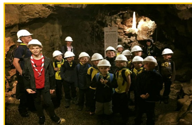
Frankby Greasby Summer Camp Thornthwaite, Yorkshire Dales