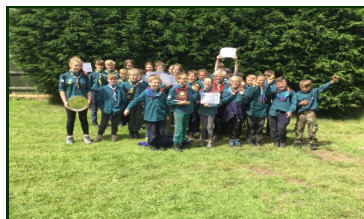
Scouts Backwoods Cooking Competition -

So what's been happening in West Wirral this month?