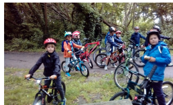
1st Thurstaston Beavers en- joying a bike ride along the Wirral Way