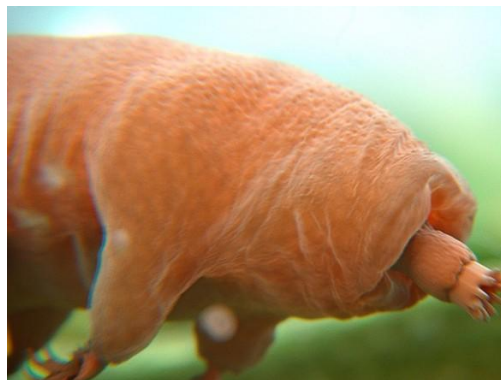
This is a Tardigrade which can live in boiling water, solid ice and intense radiation. It can live for a decade in a desert with no water and the deepest trenches in the ocean. So living in space should not be a problem. They have already been on space mission and survived.

The Scouts had their own go at building rockets from pop bottles to be powered by water and air pressure. They were challenged to build a rocket that could be launched with an egg on board, which could be landed intact.