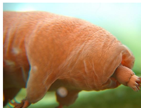
This picture was used in the Astronautics presentation. Is it an alien life form?

During the term both Troops took part in District events and a County camp, "The Great Escape". Additionally 3