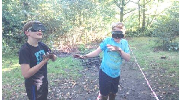
The Blindfold Trail at The Beavan