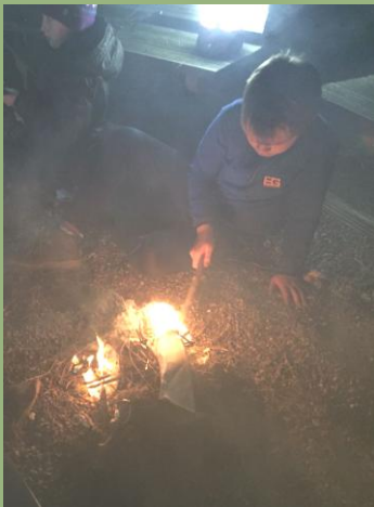
Why does fire fascinate us so much?

The Scouts were shown how to wire plugs, join pipework and using power tools.