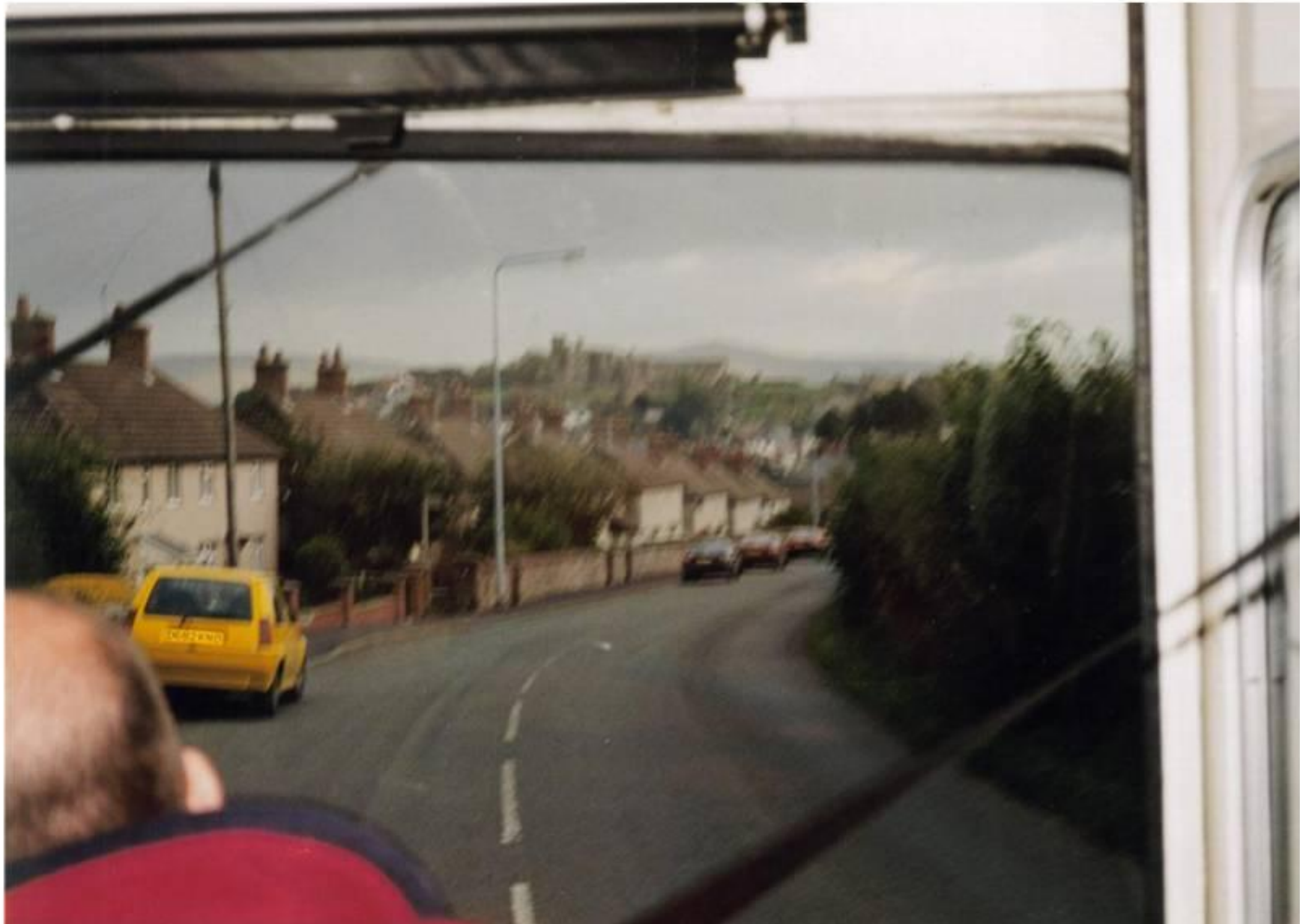
View Of Denbigh Castle On The Way Home