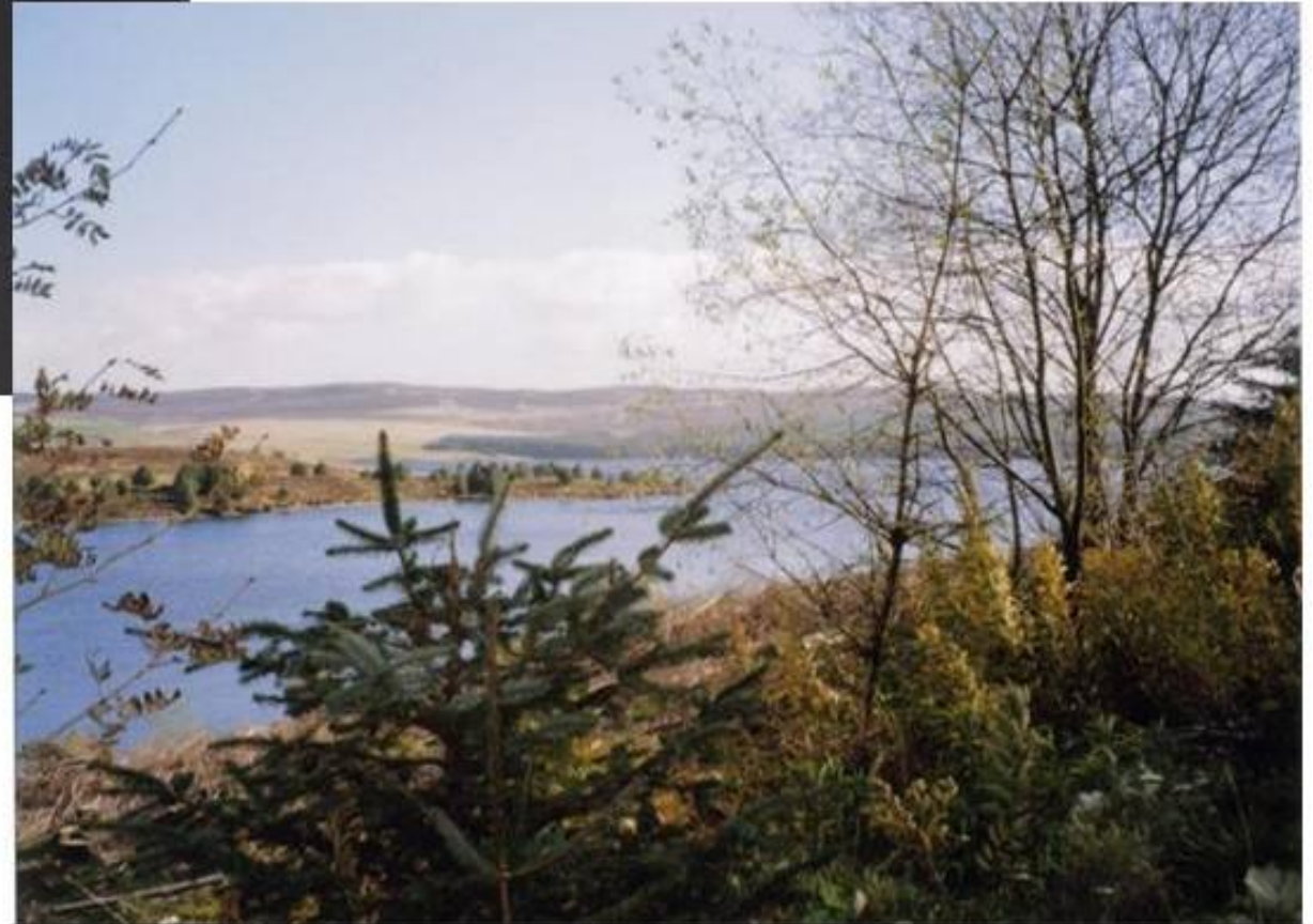
Arriving At Llyn Brenig