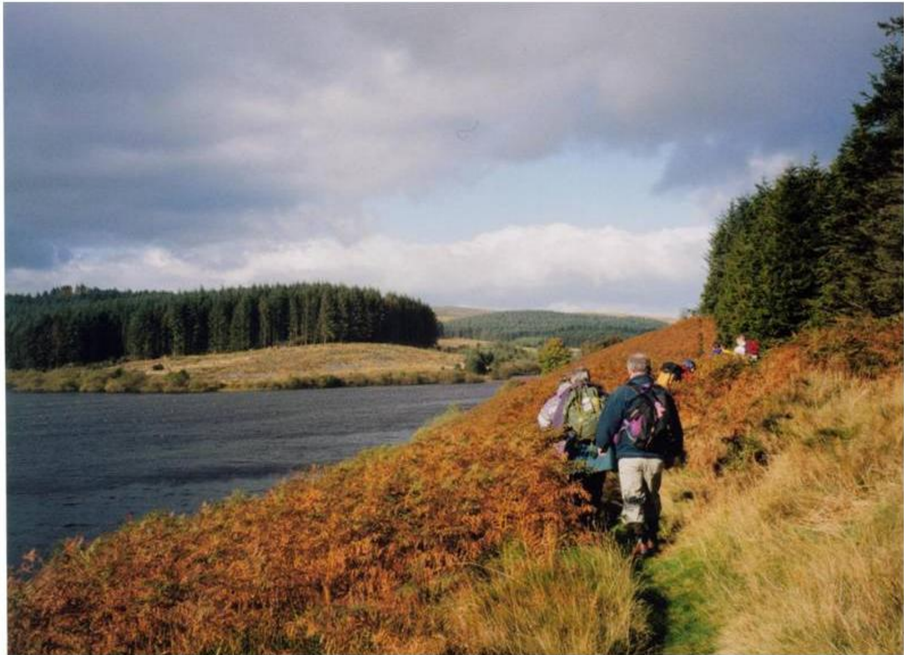
Setting Off Along The Shore Of Llyn Alwen