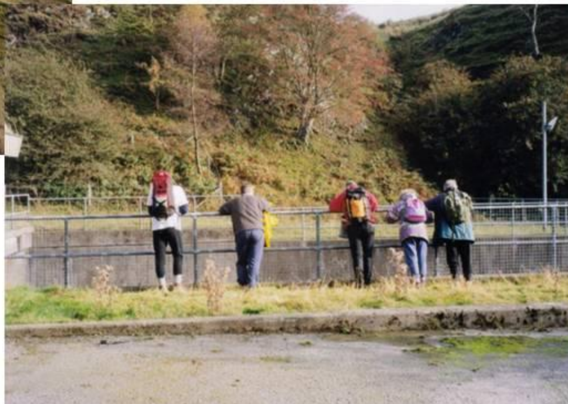
On The Dam Wall Of Llyn Brenig