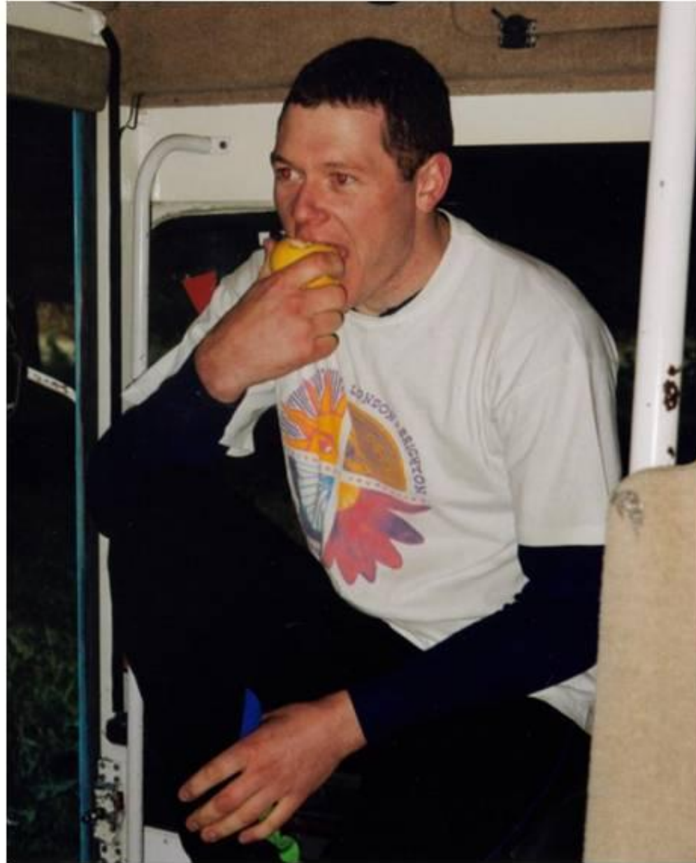
Feeding Time !