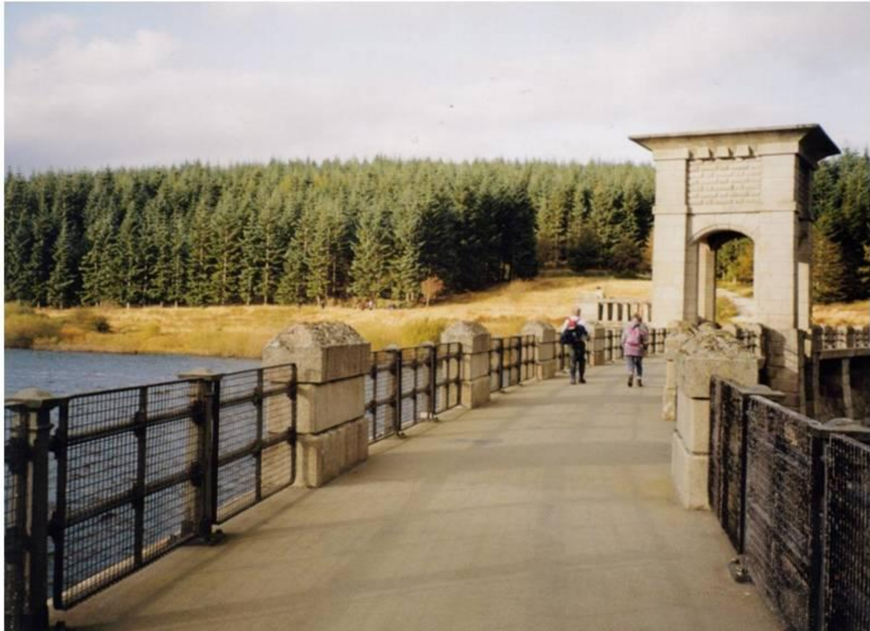
On The Dam Wall Of Llyn Alwen