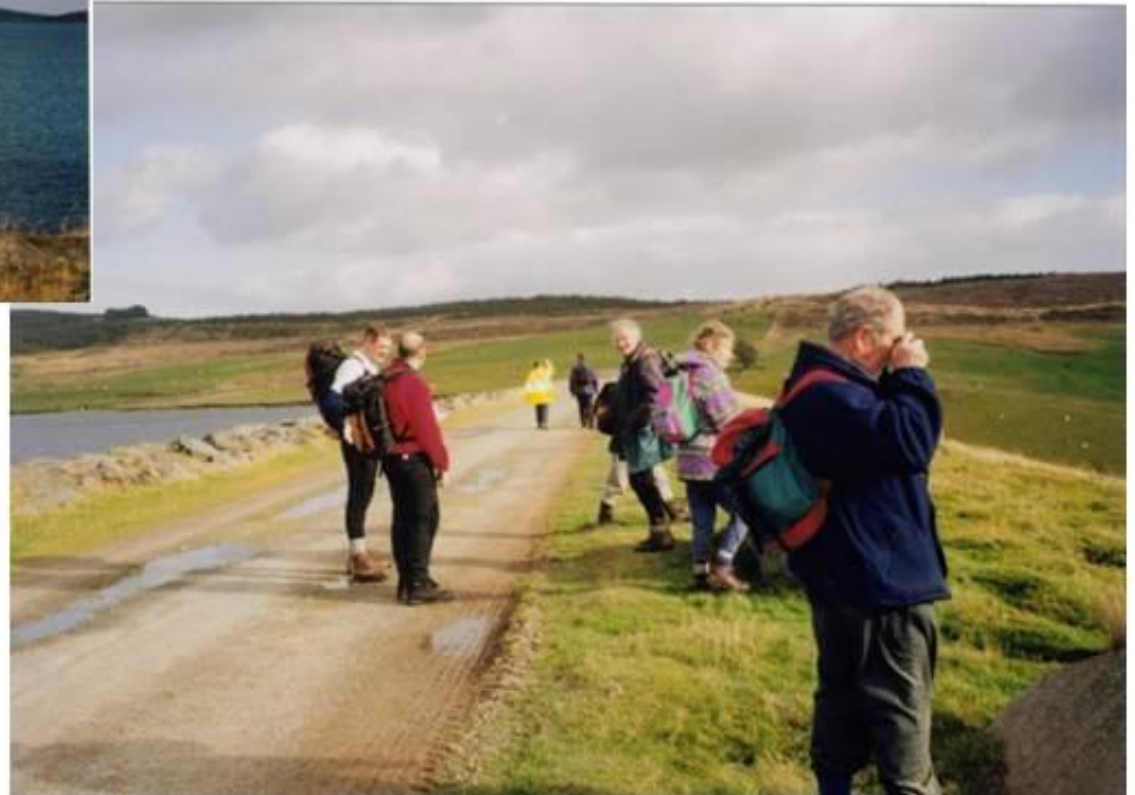
On The Dam Wall Of Llyn Brenig