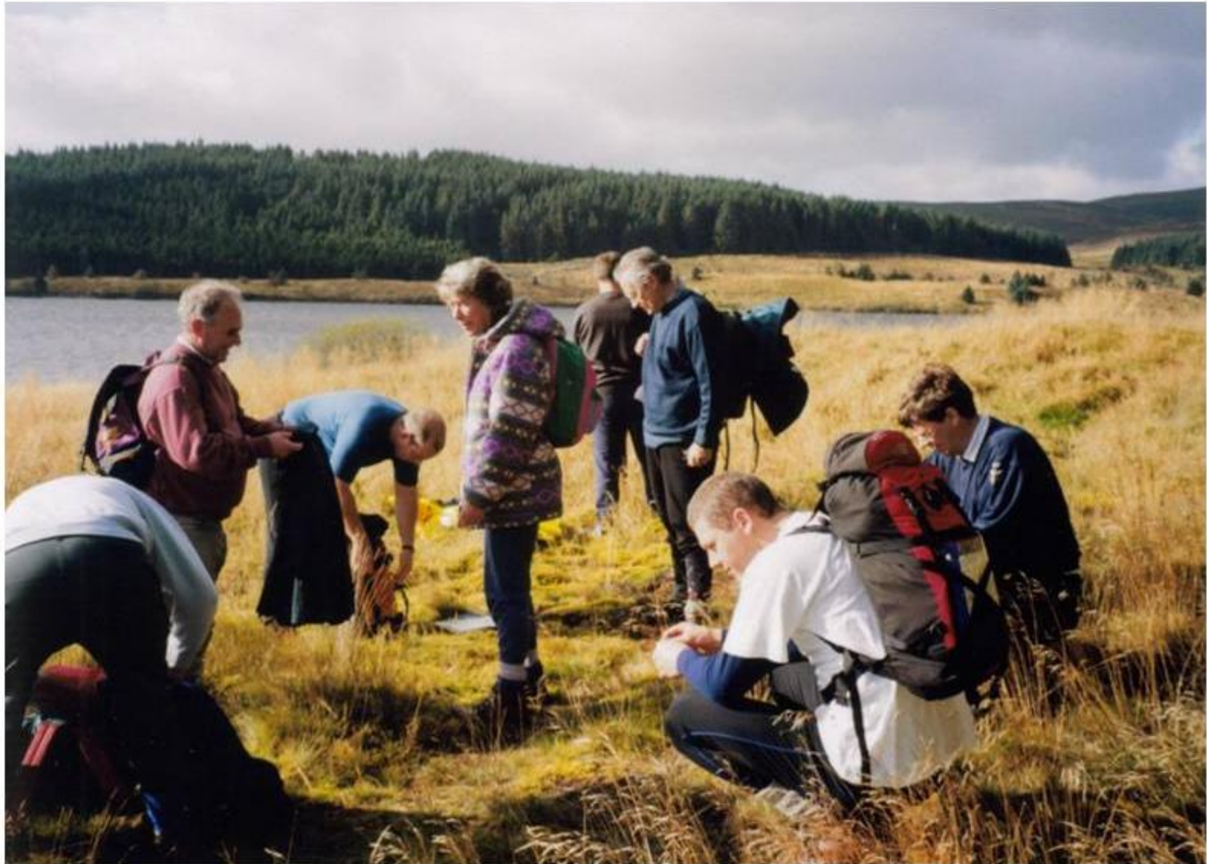
First Stop To Cool Off