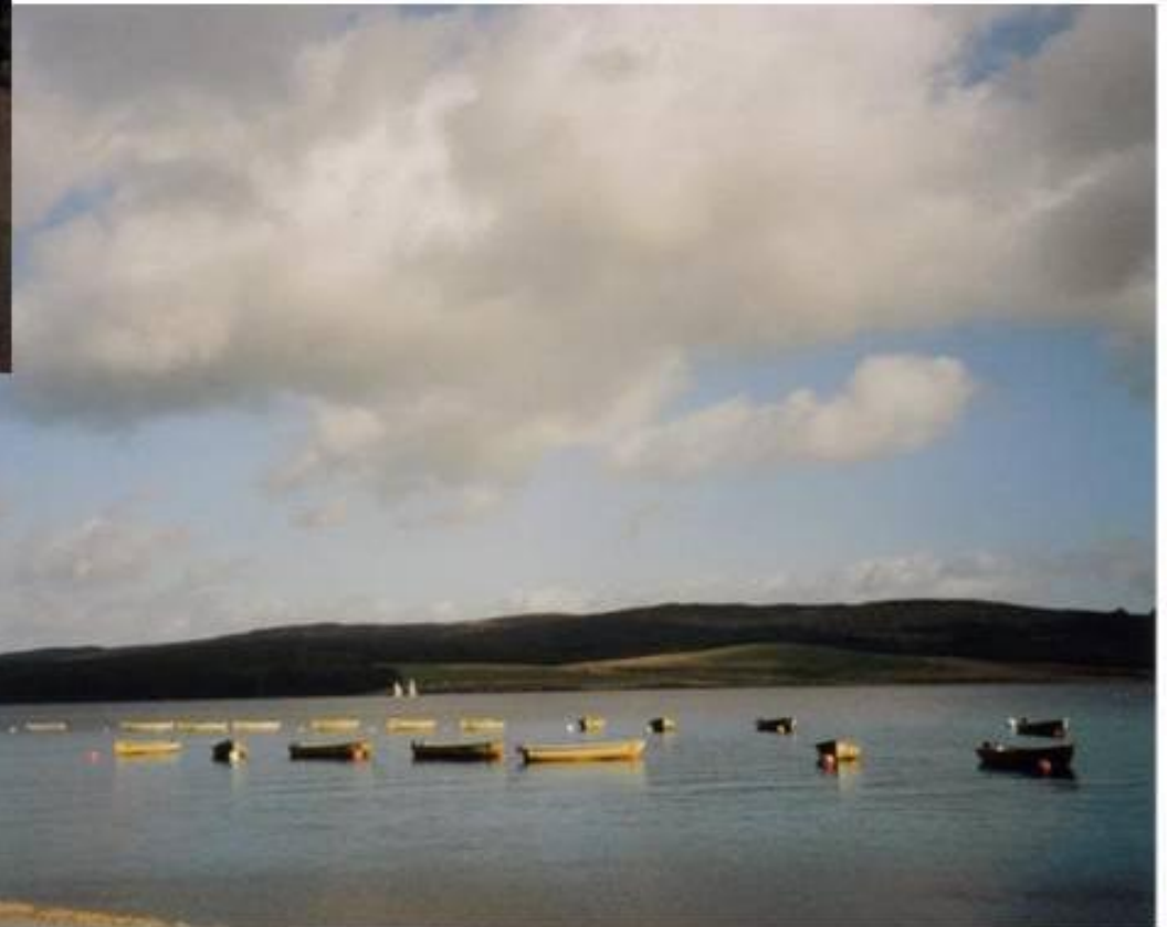
Views Of Llyn Brenig