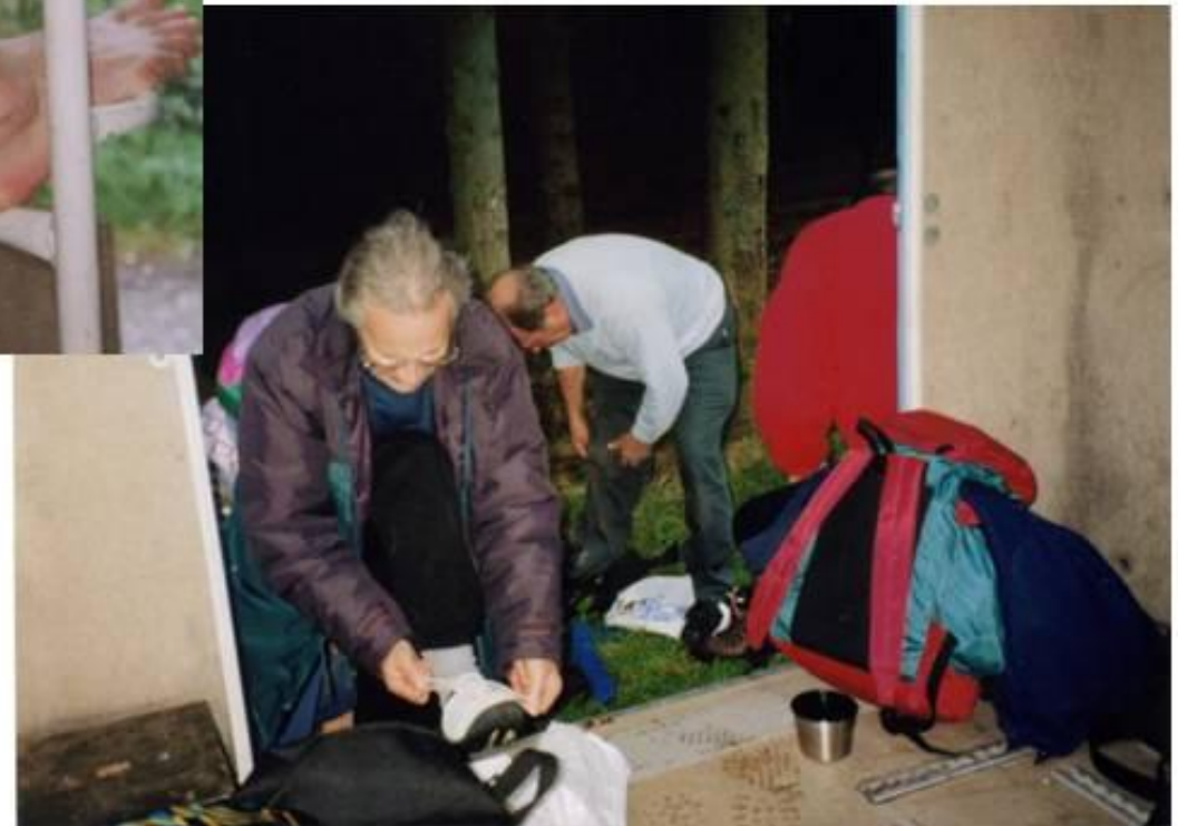
Back At The Bus - With Steaming Feet !