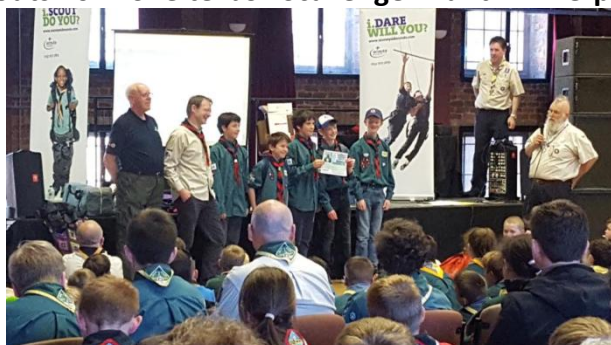
6 th Heswall team at the winner's presentation.