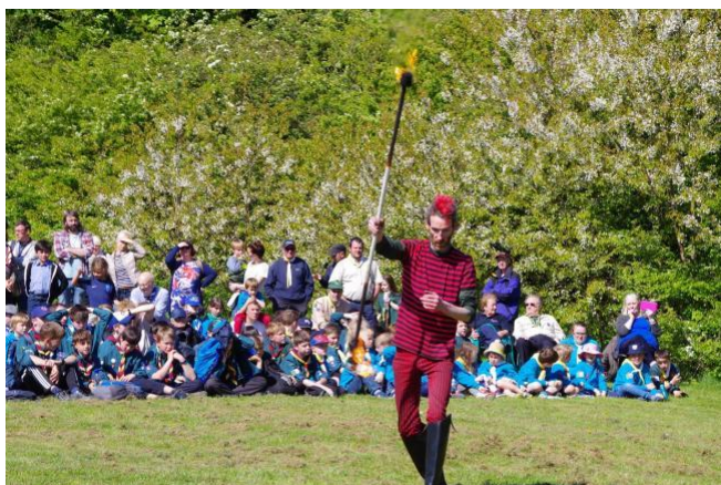
Families and members of the Scouts watching fire juggling at the St George's Day celebration