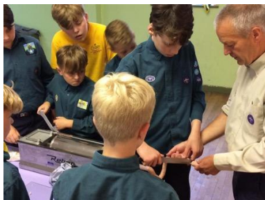
1 st Frankby Greasby - Sausage Making