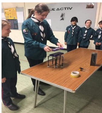
Overchurch Upton - Straws and Chocolate