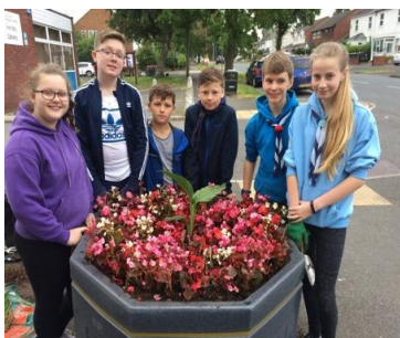
1 st Barnston – Planting Community Flower Beds