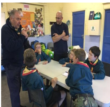
7 th Moreton – Patrol Teamwork