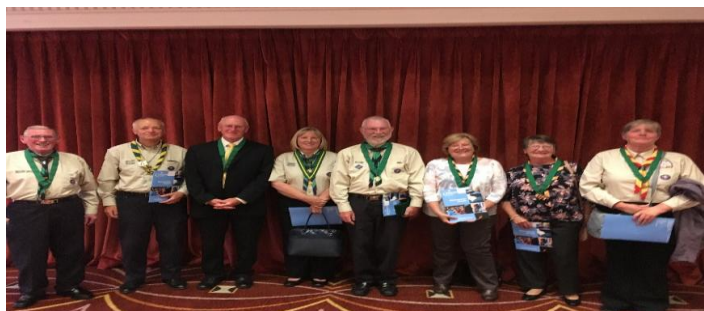
West Wirral Awards