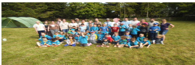
Distri ct Beav er Cam

New WW Choir for Scout/Guide Leaders, Explorers and Rangers